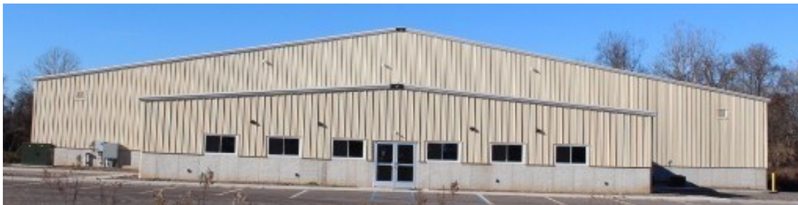
Ready to Move In — Ingenuity Center, 300 Commerce Drive, Marietta OH 45750 35,000 sq. ft. manufacturing facility—for lease or sale.